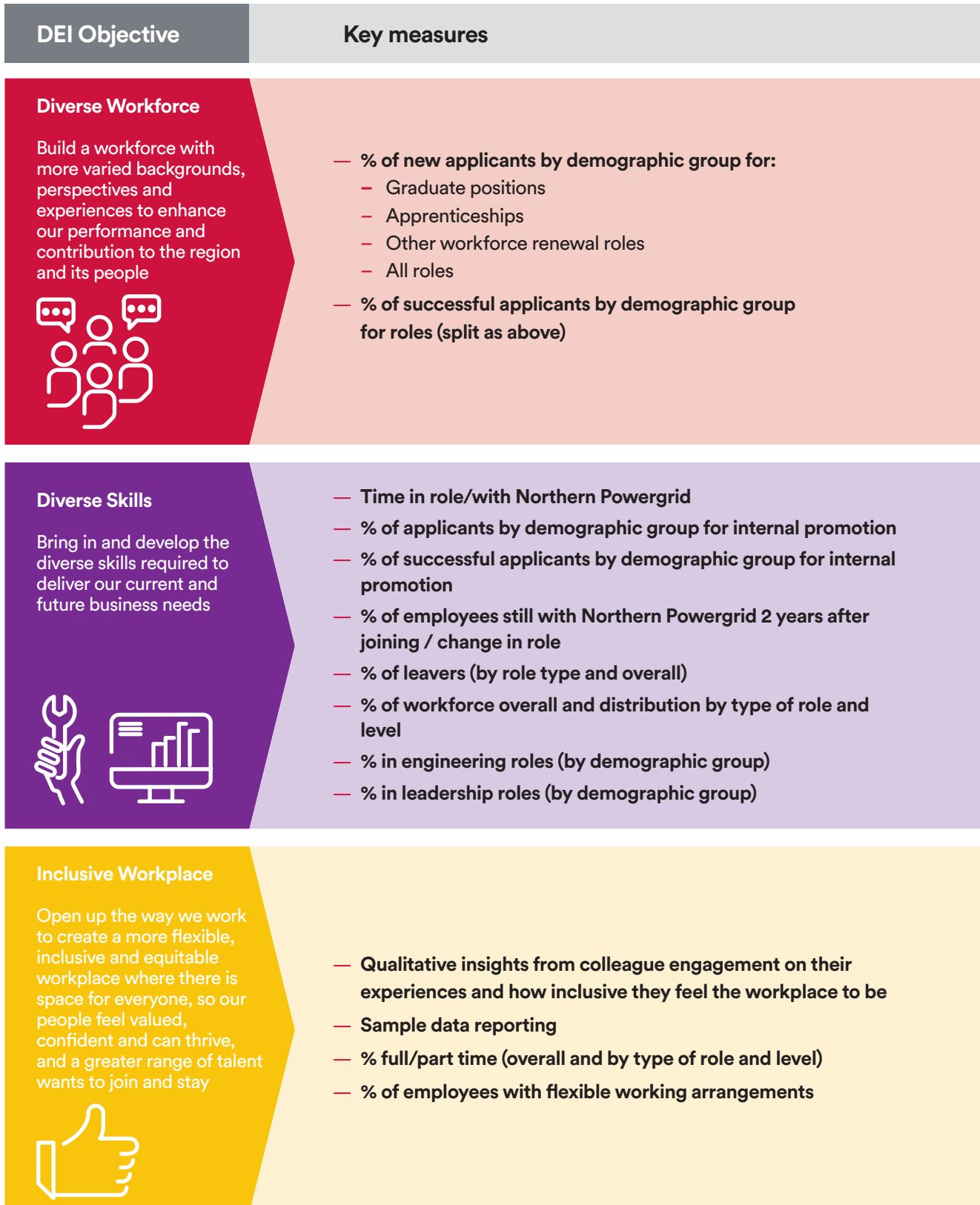
Table 2: Measures to track progress that will be reported internally